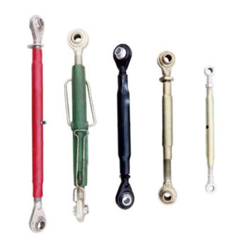
HITCH BAR, 3-POINT HITCH